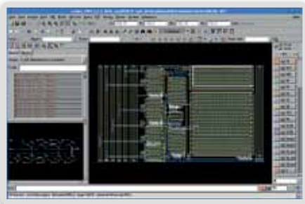
Figure 1: Laker FPD schematic-driven flow with reference device PDK